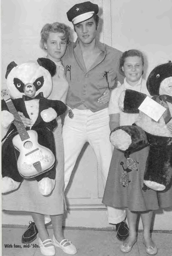
With fans, mid-'50s.