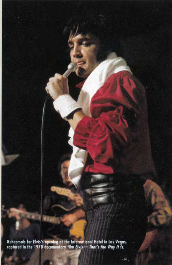
Rehearsals for Elvis's opening at the International Hotel in Las Vegas, captured in the 1970 documentary film Elvis—That's the Way It Is .

Music and lyrics by Joe Morris. RCA LP APL1 1039 (1975) Did not chart. Regent Music Corp./T.M.I.B. Music. BMI.