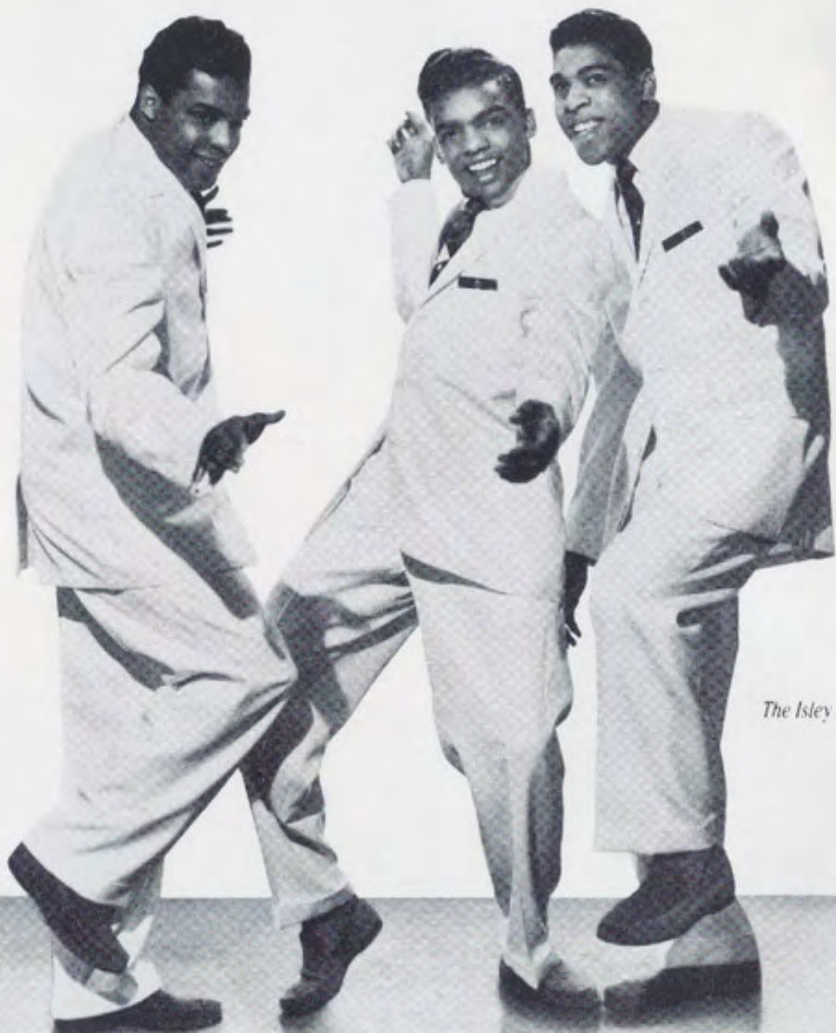
The Isley Brothers