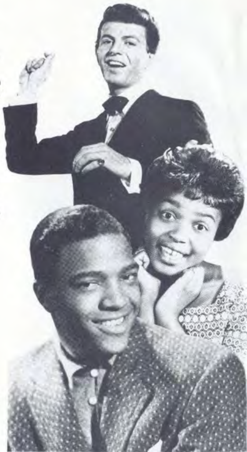
Dion, Little Eva and Clyde McPhatter, top to bottom