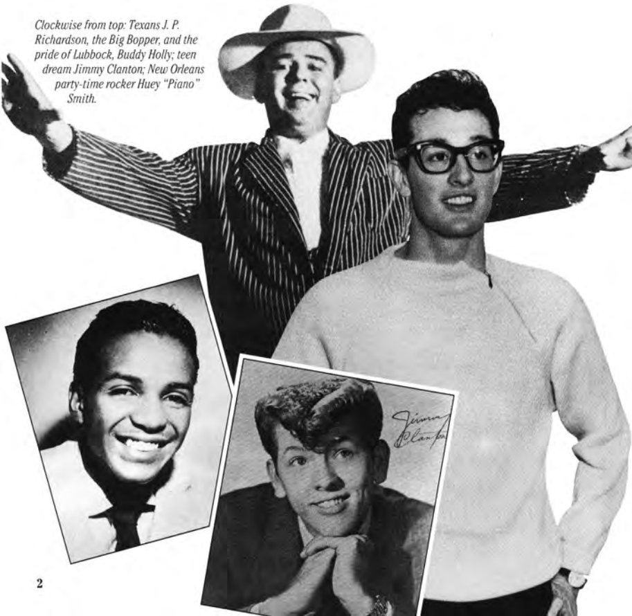
Clockwise from top: Texans J. P. Richardson, the Big Bopper, and the pride of Lubbock, Buddy Holly; teen dream Jimmy Clanton; New Orleans party-time rocker Huey "Piano" Smith.