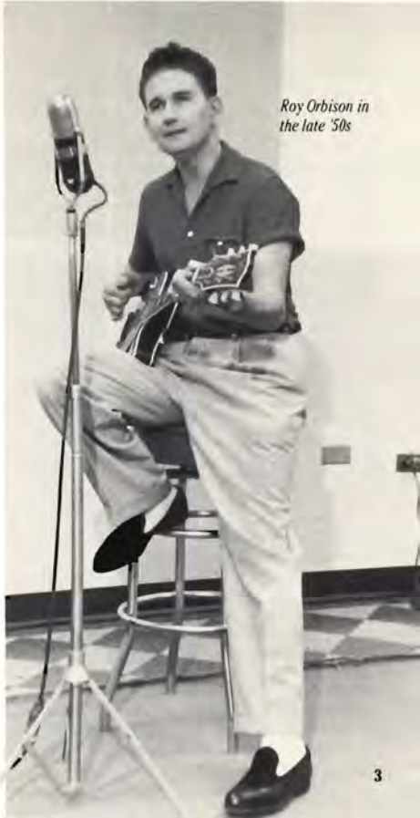
Roy Orbison in the late '50s

Red Bird's most successful act was the Shangri-Las, composed of two sets of sisters from Queens (only three of the singers toured). The group specialized in teen-age minidramas wherein lead vocalist Mary Weiss was caught between the temptations offered by "bad boys" and peer-group and parental pressures. In Leader of the Pack , Mary's love affair with a motorcycle ace