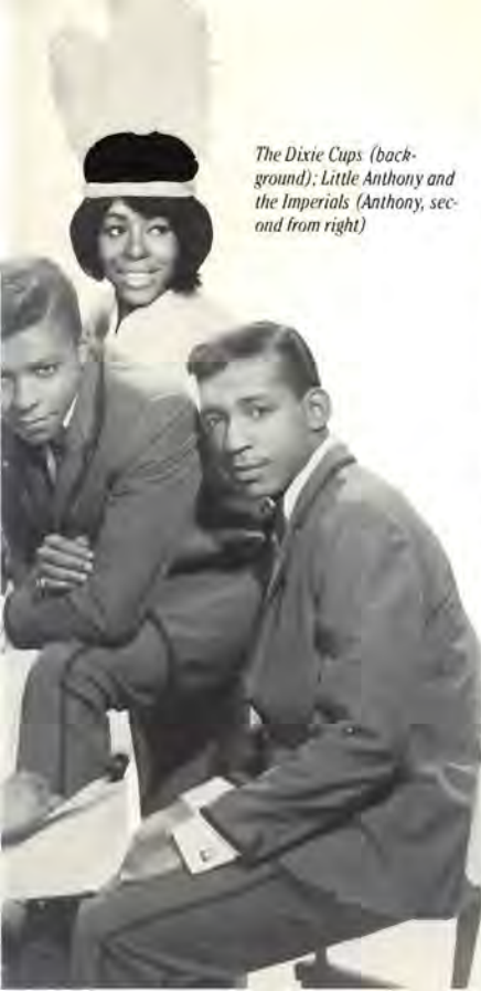
The Dixie Cups (background); Little Anthony and the Imperials (Anthony, second from right)

artist to place a Jagger-Richards song on the American charts when he had minor success with their song That Girl Belongs to Yesterday .