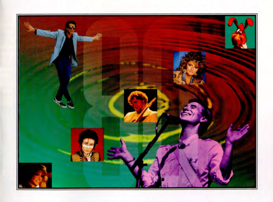
THE EARLY '80S